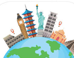
International Exposure Course/Modules