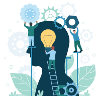
Mentorship Based Learning