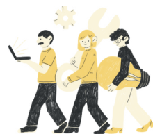
Research Based Learning