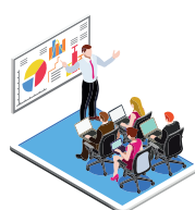
Industry based Short Term Courses