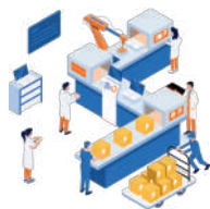
Industry Interface Sessions